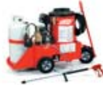
Model 558-Propane (Shown with optional Portagear & Propane Tank)