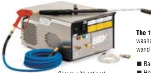
Shown with optional stainless steel cabinet