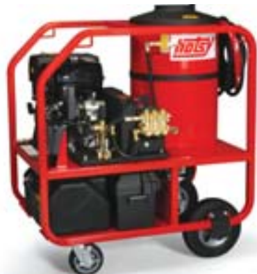
1075BE (Shown with optional caster wheel kit)