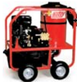
965B (Shown with optional pneumatic tires)