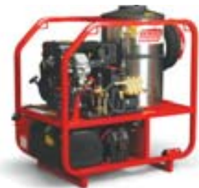
1080BE (Shown with optional stainless steel coil wrap and skid rails)

The belt-drive versions of the Gas Engine Series provide versatility with the roll cage design. Designed to fit the needs of the end-user, this versatile hot water washer converts easily to a skid unit, portable with wheels or a wheel/caster kit, or can be mounted on a trailer. Powered by reliable gasoline engines, the four models offer a broad range of cleaning power, from 3.0 to 4.6 GPM and from 3000 to 3500 PSI. All models are backed by Hotsy's 7-year pump warranty and all are ETL safety certified. All models are equipped with a standard pressure switch and 50' hose.