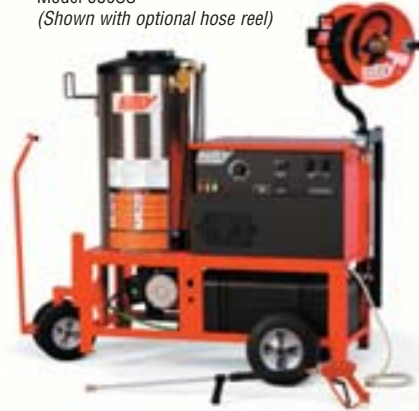
Model 980SS (Shown with optional hose reel)