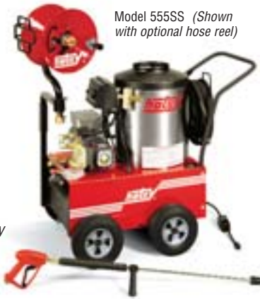
Model 555SS (Shown with optional hose reel)