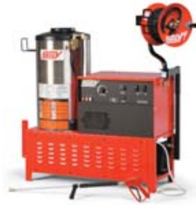
Model 1412SS (Shown with optional hose reel. Portability not available on gas fired models)