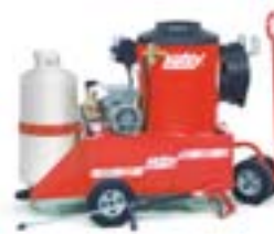
Model 771-Propane (Shown with optional Portagear & Propane Tank)