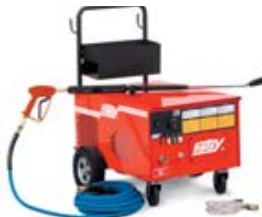
Model 1710 shown with optional wheel kit (PN 9.801-031.0).