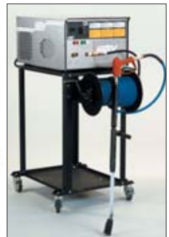
1700 Series shown with optional hose reel kit, (PN 8.903-039.0), cart (PN 8.903-037.0), caster wheel kit (PN 8.903-038.0) and stainless steel base and cover (PN 8.903-042.0).