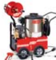
Model 560SS (Shown with optional hose reel)