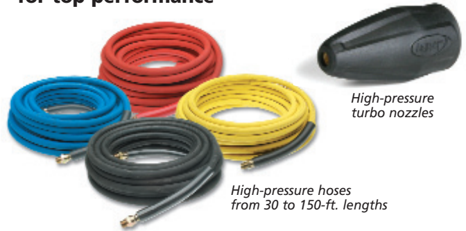
High-pressure turbo nozzles