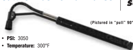
(Pictured in "pull" 90° position)