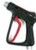
Model 80 "Big Black Gun"